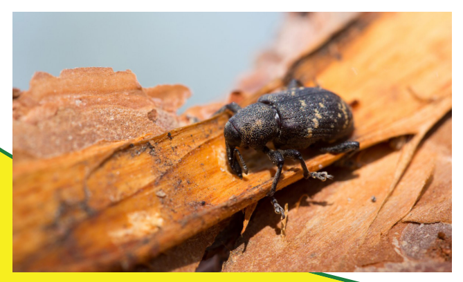
Bark Beetle (Dendroctonus Ponderosae)